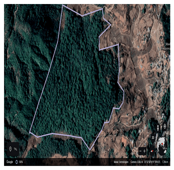
Fig. 4: Aerial view of Law Lyngdoh Mawlong sacred groves