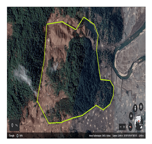
Fig. 3: Law Lyngdoh Nonglait sacred groves source: Google

and 91° 35' 44" E longitude (Fig. 2). Law Lyngdoh Nonglait, located in Nonglait village within Hima Mawiang Syiemship, spans approximately 50 hectares and is located at Latitude 25° 29' 12" N and Longitude 91° 30' 23" E. (Fig. 3). Law Lyngdoh Mawlong, located in Mawlong village within Hima Nongkhlaw's Syiemship, covers around 200 hectares and is located at Latitude 25° 32' 29" N and Longitude 91° 38' 40" E. (Fig. 4)