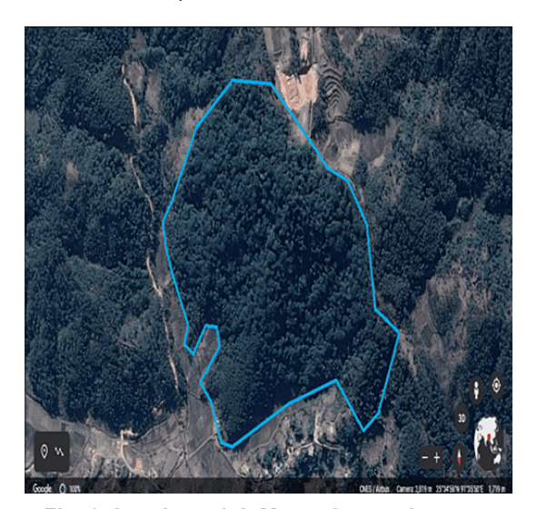
Fig. 2: Law Lyngdoh Mawnai sacred groves

Law Lyngdoh Mawnai, located in Mawnai village within Hima Nongkhlaw's Sylemship, spans 23.7 hectares and is positioned at 25° 34' 48" N latitude